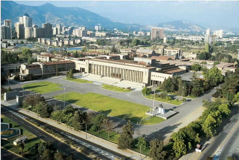
Santiago de Chile, Escuela Militar

The ICA, for its part, assisted attendance by means of a travel award program for young paper authors, successfully managed a Refereeing process (a first for the ICC conferences) for improving some of the papers submitted, and ran a competition in the context of the Cartographic Exhibition with awards for several maps.