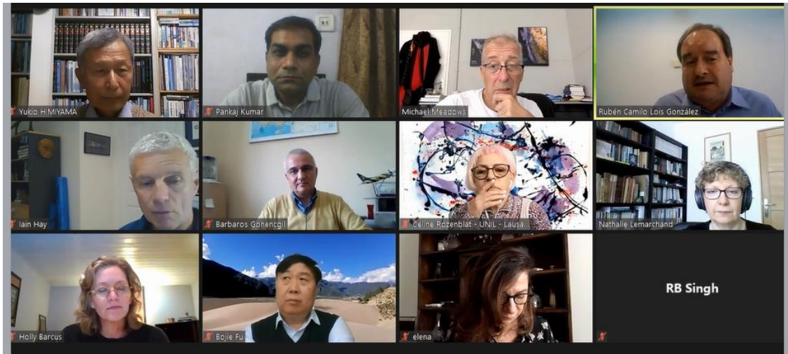
Screenshot of the First EC meeting of year 2021 on 8 th April, 2021