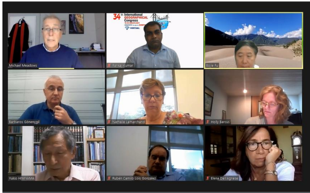
Screenshots of the August 2021 EC Meeting